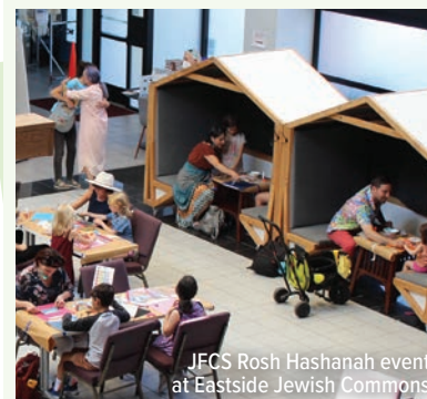
JECOS Rosh Hashanah event at Eastside Jewish Commons

Jewish Federations of North America Kehillah Housing Kol Shalom Kroger Family of Companies Maayan Torah Day School Mittleman Jewish Community Center Morel Ink Multnomah County National Council for Mental Wellbeing Network of Jewish Human Service Agencies New Seasons Oregon Board of Rabbis Oregon Food Bank Oregon Jewish Life magazine Portland Jewish Academy Positive Charge! PDX Resilience Roundtable Safeway SDRI: Self-Determination Resource Inc. Sinai In-Home Care Store to Door Trader Joe's Trillium Community Health Plan Washington County William Temple House